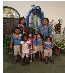
Mount Mary Feast