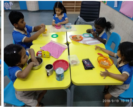
Non Fire cooking