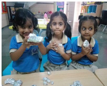
Making Moons & Rocks