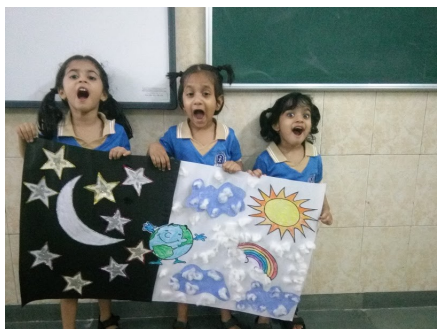
Day & Night Activity