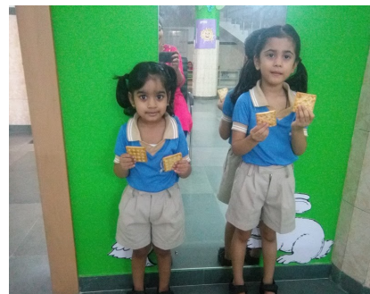
Intro to Square shape