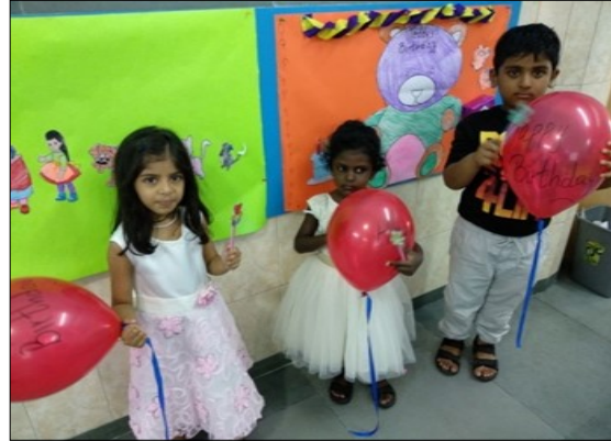
Teddy's Birthday Celebration