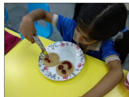
Non Fire Cooking