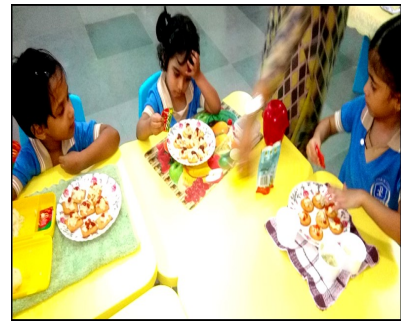
Non Fire Cooking