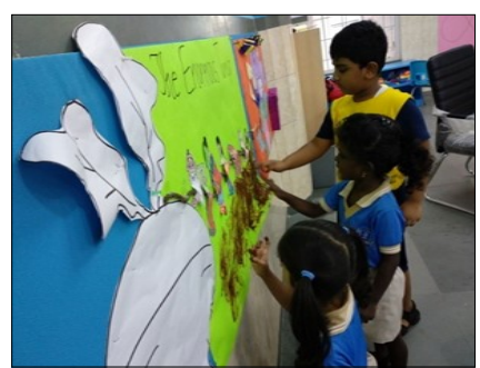
The Enormous Turnip