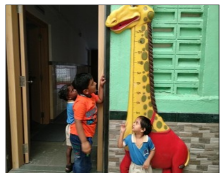
Tall & Short