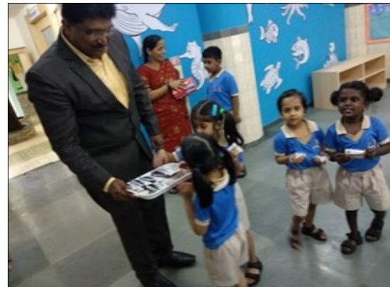
St. Pius X Feast Celebration